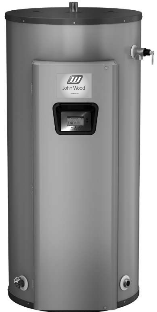
JW-EI Model Shown Above